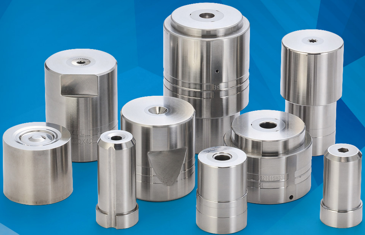
Carbide Screw Dies